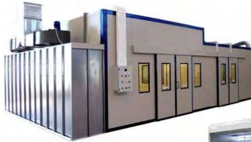
PRESSURIZED SYSTEMS FOR PAINTING