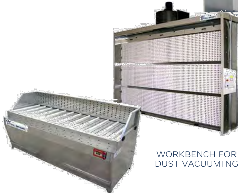
WORKBENCH FOR DUST VACUUMING