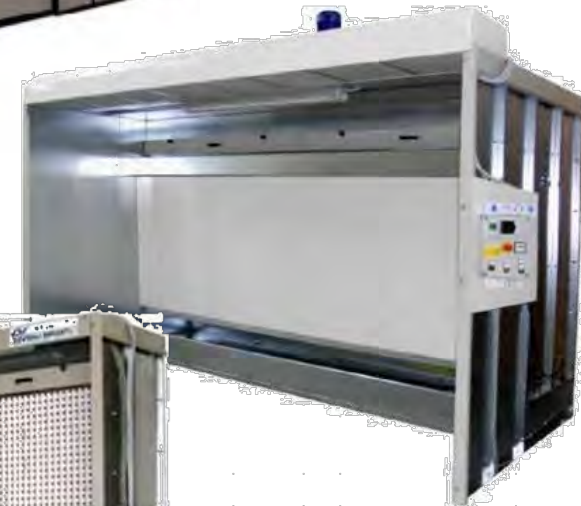
DRY PAINTING BOOTH