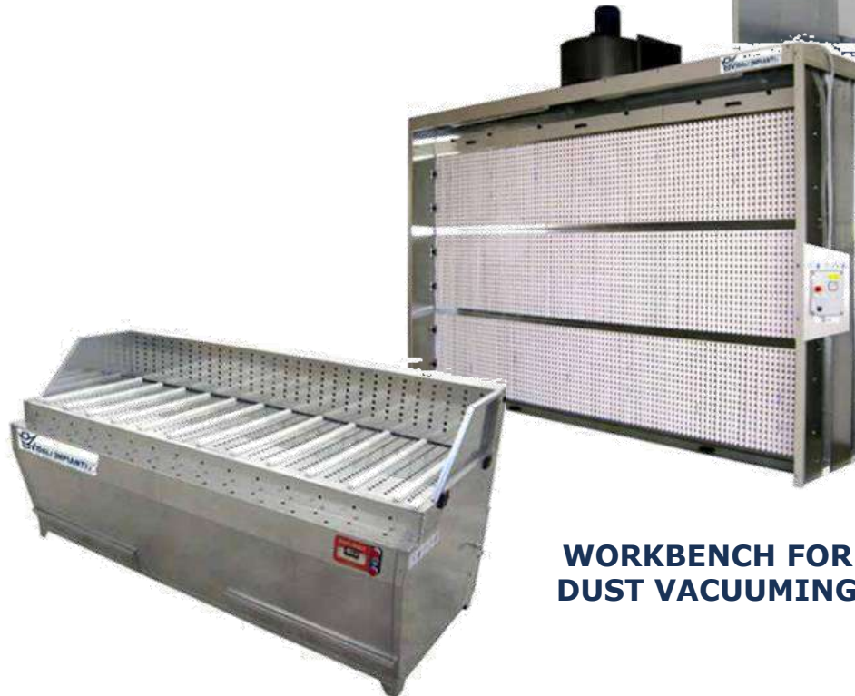
WORKBENCH FOR DUST VACUUMING