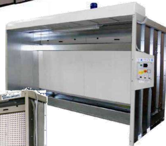
DRY PAINTING BOOTH