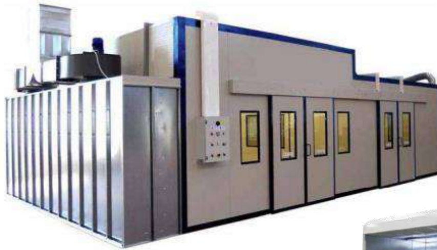
PRESSURIZED SYSTEMS FOR PAINTING